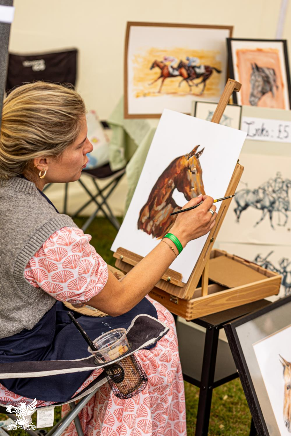
EXHIBIT MIDHURST TOWN CUP SUNDAY 29 TH JUNE 2025

Get ready for an unforgettable family day out, where thrilling high-goal polo meets a lively array of attractions beyond the pitch. Cowdray brings its unique twist to the classic British village fete, celebrating the best of the Cowdray Estate and the vibrant local community.